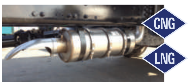
Three-Way Catalyst Aftertreatment

The ISL G is capable of operating on compressed or liquefied natural gas (CNG, LNG). The ISL G can also operate on up to 100 percent biomethane – renewable natural gas made from biogas or landfill gas that has been upgraded to pipeline- and vehicle fuel-quality.