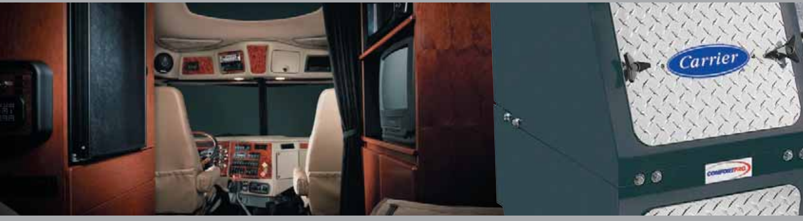
Auxiliary power unit with DELTEK™ hybrid diesel-electric technology.